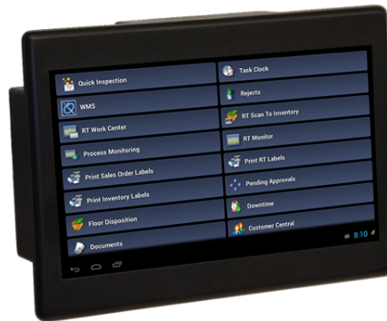
Above: Shop floor tablet applications